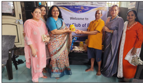
Provided groceries at Maru Ghar