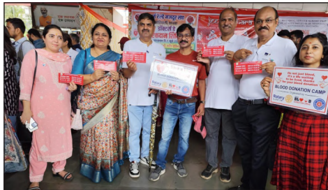
Blood donation camp at Borivili Station