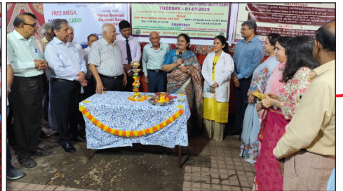
Mega Medical camp at Gujarati Seva Mandal