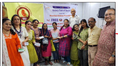
Free Medicines for Blood Pressure and Diabetes