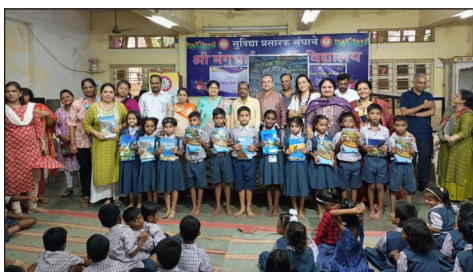
Books distribution to students of Yojana Vidyalaya at Borivali East