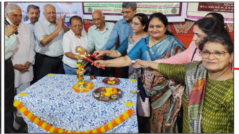
Mega Medical camp at Gujarati Seva Mandal