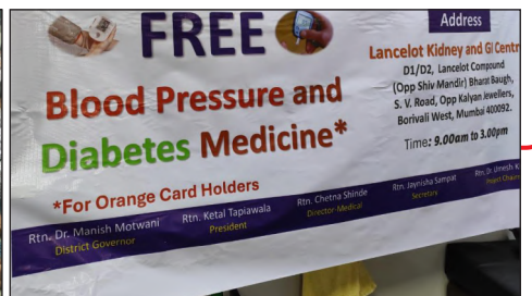
Free Medicines for Blood Pressure and Diabetes