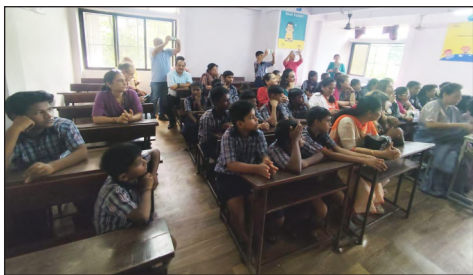
Adoption of students at Jeevan Bima Nagar School