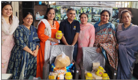
Provided groceries at Maru Ghar