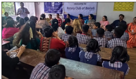
Adoption of students at Jeevan Bima Nagar School