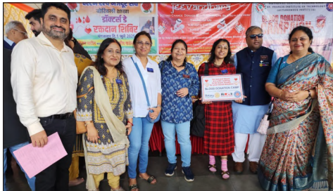
Blood donation camp at Borivili Station