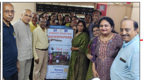
Installation of old newspaper collection box