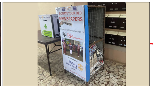
Installation of old newspaper collection box