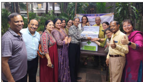
Installation of box for collection of unused medicines