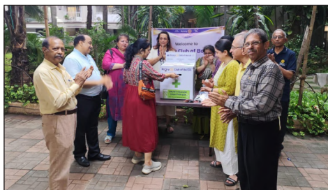
Installation of box for collection of unused medicines